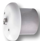
Nozzle with mounting sleeve