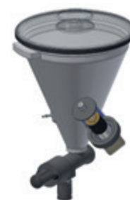
Fig.: Dosing unit for GRANUDOS-FLEX