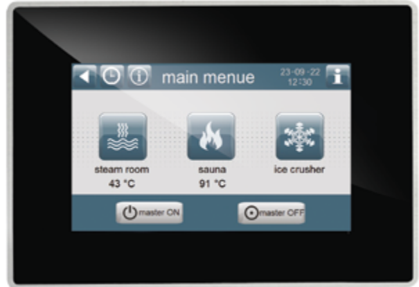
Touch Display, 4,3", 64000 colours

Systems for the central control of all cabinets (saunas, steam rooms etc.), their components (sauna heaters, steam generators, fragrance dosing, illuminations etc.) and parameters (temperature, humidity etc.) of a Wellness area from one central display. The central control systems are planned and produced project-based. Therefore the systems can be adapted individually to the requirements of a project. For the operation and visualisation we use clearly designed and intuitively arranged touch screens from 4,3" to 10". They can be programmed in several languages. Furthermore measured values, current operational status and alarms can be displayed with each browser driven device such as a PC, smartphone or tablet.